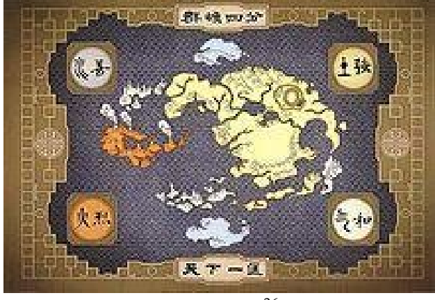
Figure 1: Map of the Four Nations<sup>36</sup>

The ability to manipulate and control air currents is referred to as an aerokinetic ability ; airbending is one of the most fluid and energetic of the four bending arts.<sup>35</sup> Colored in white in Figure 1, the Air Nomads resided in four temples in each corner of the world.